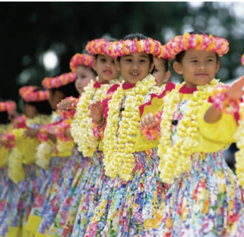
Keiki girls dancing hula

Though guidebooks are a great starting point for canvassing the Hawaiian Islands prior to a visit, sometimes travelers want extra knowledge that can't be found on the pages of a tome. The best way to learn about the culture and activities that await — from Hawai'i residents who've made certain cultural elements of the islands not only their passion, but part of their lifestyle.