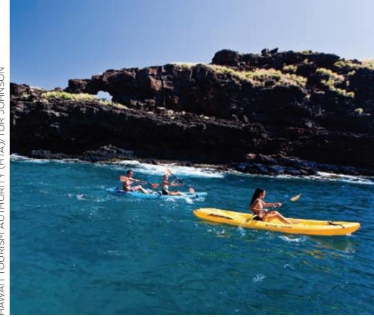
Kayaking in Hulopoe, Lāna'i

Director of the Royal Hawaiian Center, recommends attending performances (6:30 p.m.; Tuesday – Friday) by different artists at the Center's Royal Grove. Complimentary, hour-long introductory hula classes (11 a.m. Tuesdays, 4 p.m. Thursdays) are offered at the Royal Grove as well.