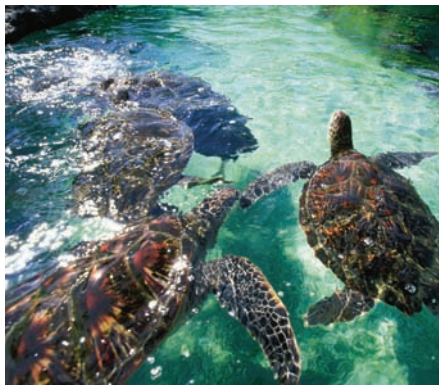
Sea Turtles at Maui Ocean Center in Maalaea, Maui